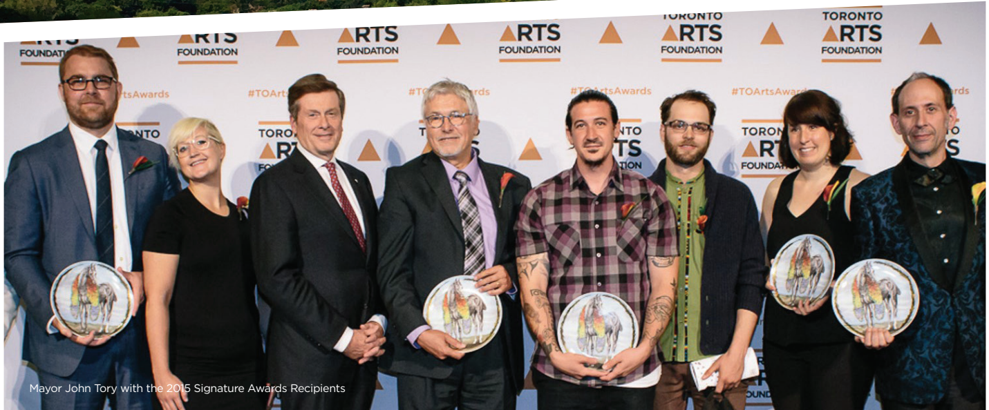
Mayor John Tory with the 2015 Signature Awards Recipients