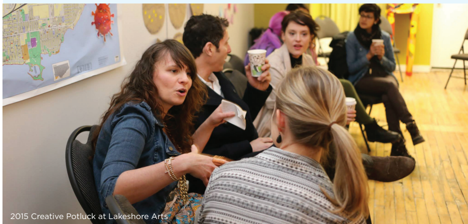
2015 Creative Potluck at Lakeshore Arts

For more information please visit: NeighbourhoodArtsNetwork.org .