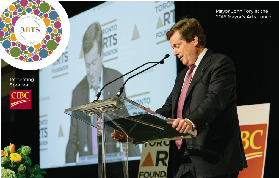
Mayor John Tory at the 2016 Mayor's Arts Lunch