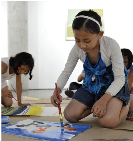
Doris McCarthy Gallery workshop.