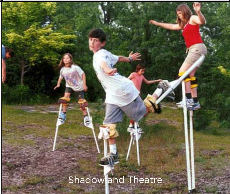
Shadow and Theatre

Comments from participants Art Starts Neighbourhood Cultural Centre’s Glendower Basketball Court Mosaic Project, facilitated by Red Pepper Spectacle.