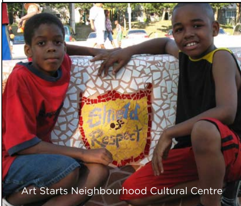
Art Starts Neighbourhood Cultural Centre

In order to support this vital work, the Toronto Arts Foundation is creating the Neighbourhood Arts Network , as part of the on-going Block by Block Program .