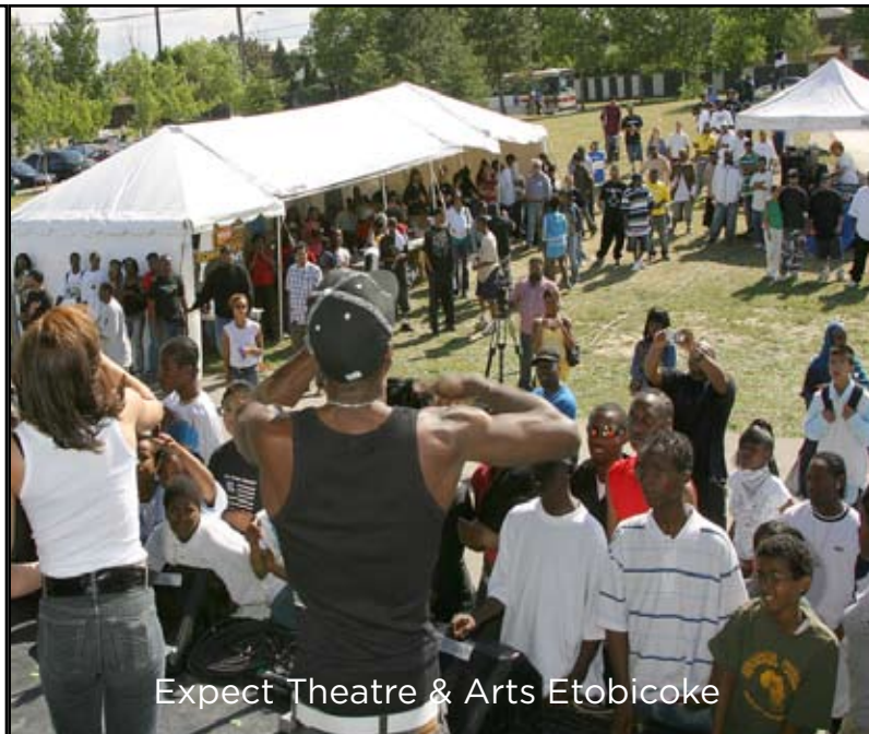
Expect Theatre & Arts Etobicoke

Artists are providing an incredible array of community-engaged professional arts programming across the city of Toronto; in our parks, apartment buildings, public spaces, libraries, theatres, storefronts and more.