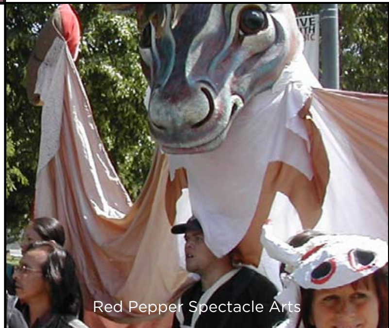
Red Pepper Spectacle Arts

The Neighbourhood Arts Network , in combination with the Block by Block Fund , will foster creativity at the local level and enhance the quality of life in Toronto's diverse neighbourhoods, making Toronto a truly creative city.